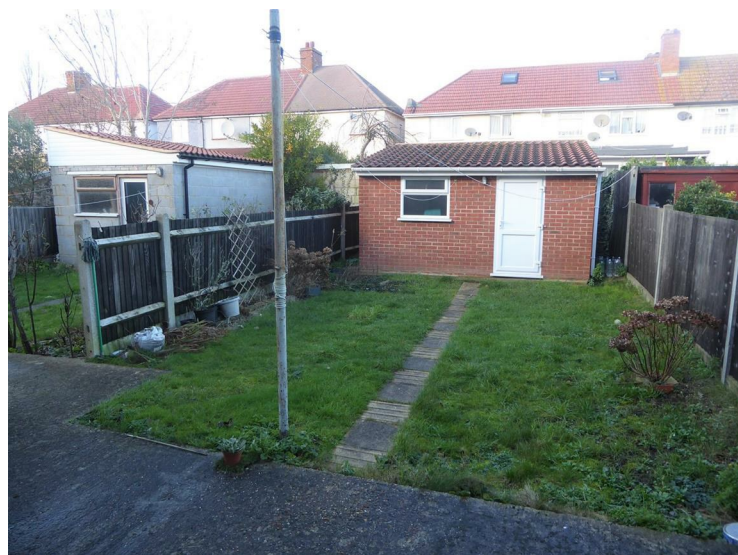
Concrete area, rest laid to lawn, brick built storage room.