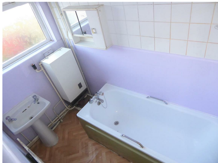
White suite comprising panel enclosed bath with mixer tap and wall mounted shower unit, pedestal wash hand basin, tiled walls, front aspect double glazed window, radiator, wall mounted boiler.