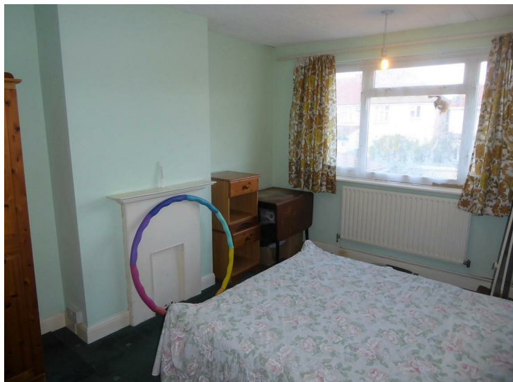
Rear aspect double glazed window, radiator, power point, cupboard housing cylinder tank.