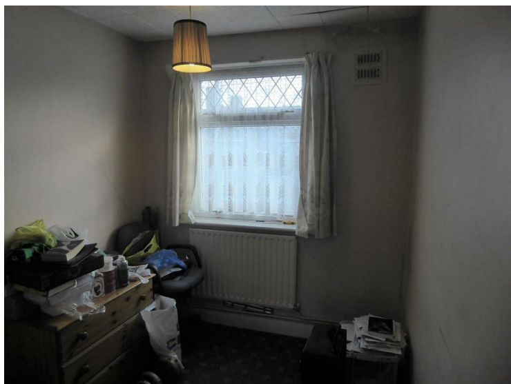
Front aspect double glazed window, radiator, power point.